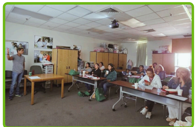
Twelve Promotores de Salud participating in the Metabolic Syndrome health campaign training.

1,159 clients were referred to healthcare services. 78% (911) self-reported that they followed up with the referral within three months.