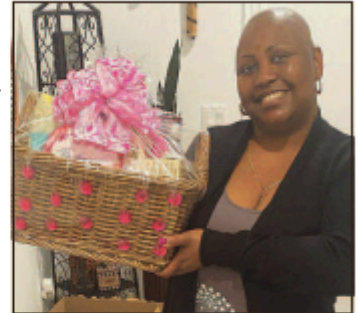
The Pink Queen Foundation