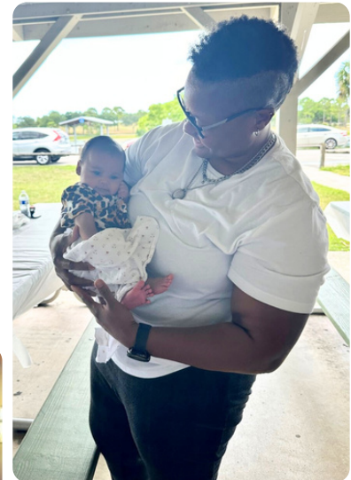
Photos from a recent Kinship Support Project gathering and community outreach.