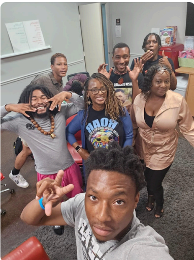
Support Group Gathering

In addition, life skills and wellness initiatives, including mobile clinic visits, sex education, nutrition programs, resilience support groups, benefits assistance, and harm reduction services, provide essential, individualized support to empower youth and promote lifelong wellbeing.