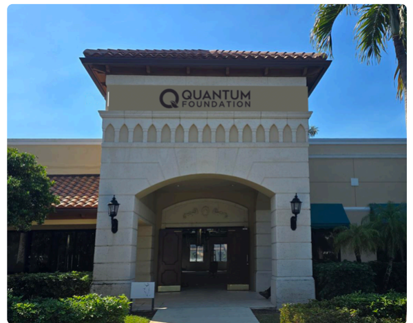
March, moving day!